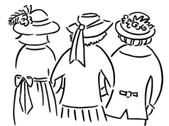
UMW mystery trip

Please call the church office to make your reservation or sign up on the bulletin board at the church. Please indicate if you can drive and how many passengers you can take. Call Ruth Sutton for more information.